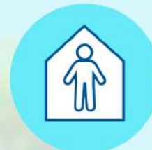
STAY AT HOME